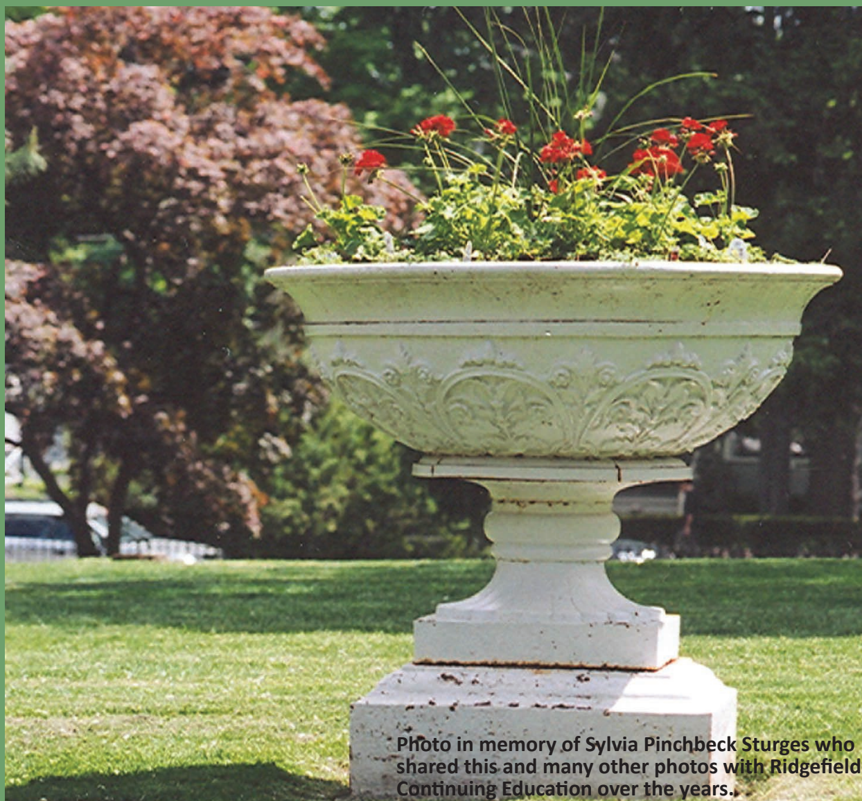
Photo in memory of Sylvia Pinchbeck Sturges who shared this and many other photos with Ridgefield Continuing Education over the years.

Courses Start on a Rolling Basis ~ Now through Spring and Summer 2024